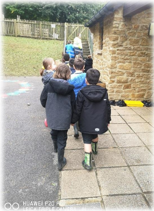
○ ○ HUAWEI P20 Pro LEICA TRIPLE CAMERA | AI