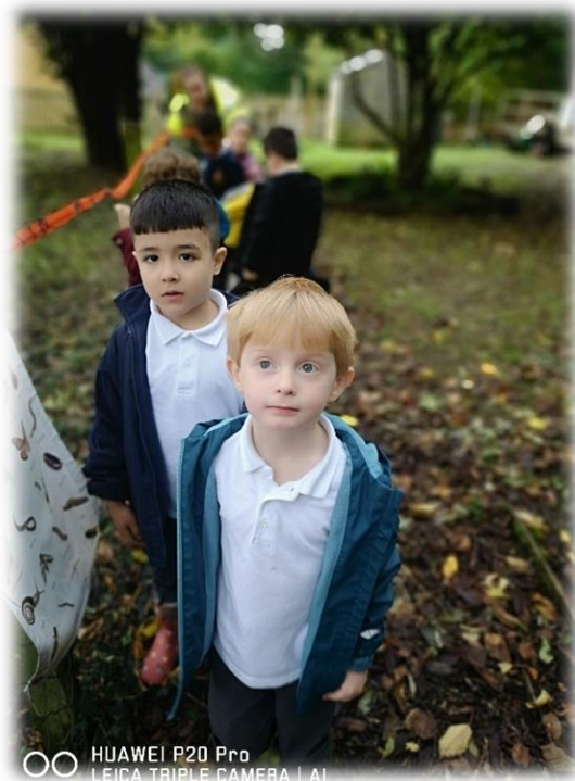
○ ○ HUAWEI P20 Pro LEICA TRIPLE CAMERA | AI

In PE we have finished our Yoga topic (jungle animal poses), though we will be continuing with our learning on Ball Skills after half term break! In Art, Class 1 have been learning about spirals! Children explored different types of media and discussed the impact. They used chalk and oil pastels to blend colours, and pencils, crayons, and collage to create spiral shapes.