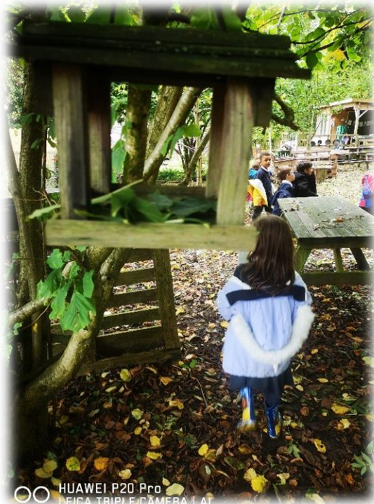
○ ○ HUAWEI P20 Pro LEICA TRIPLE CAMERA | AI