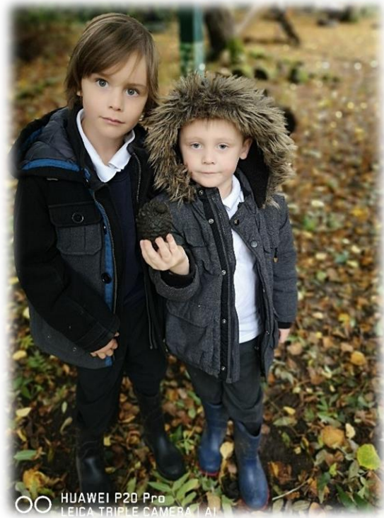
○ ○ HUAWEI P20 Pro LEICA TRIPLE CAMERA | AI